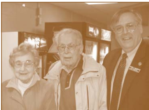
Below: Members line up for refreshments following the Annual Meeting.